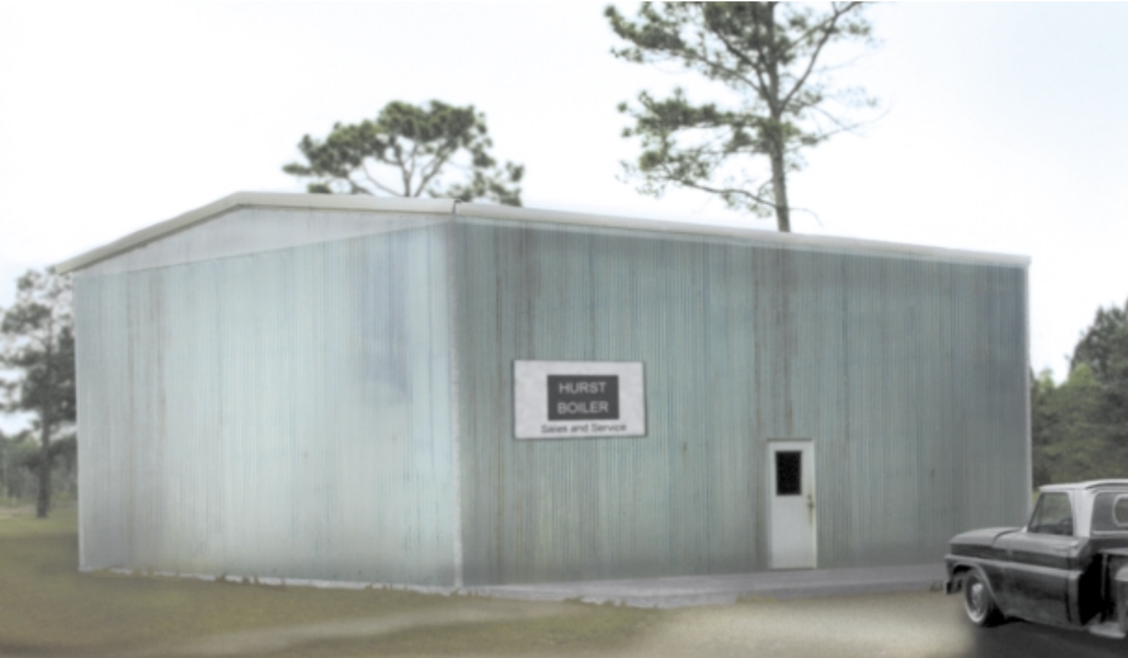
First Hurst Boiler & Welding Company shop, 1970